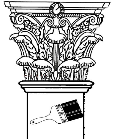
Fig. C – Apply a high quality primer before painting.