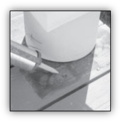
Apply construction adhesive to top and bottom surfaces of column. Use a non-acetone based exterior grade construction adhesive.