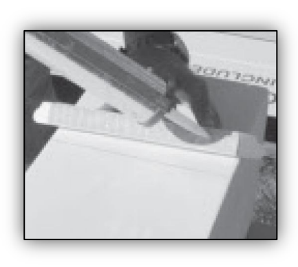
Pre-drill holes through neck mold into column. Screw neck mold in place or pre-drill and use finish nails.